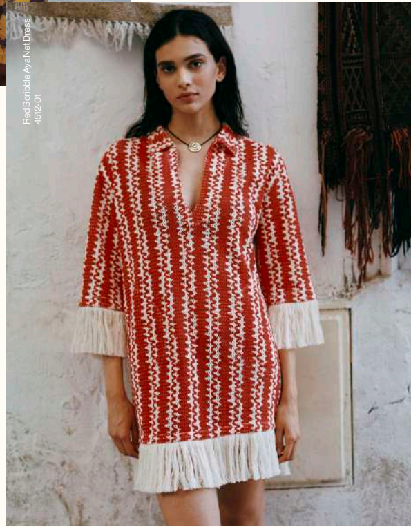
Red Scribble Avon Net Dress 4512-01