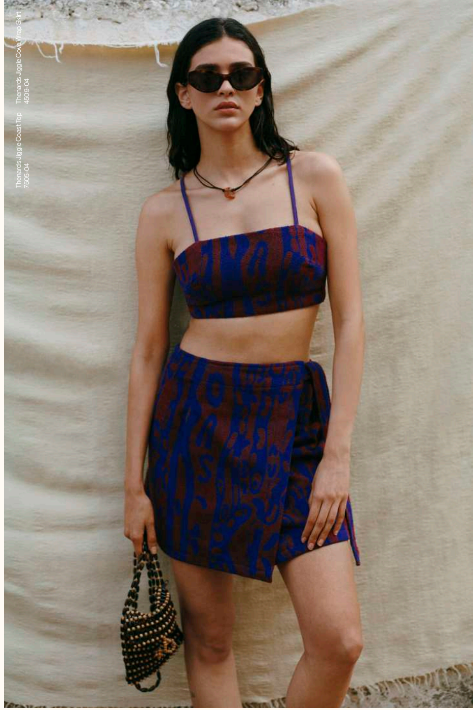
Thenards Juggle Coast Top Thenards Juggle Cove Wrap Skirt 7505-04 4509-04