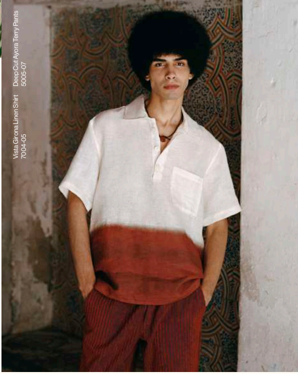
Vista Girna Luren Shirt Deep Cut Ayora Terry Pants 7004-05 5005-07