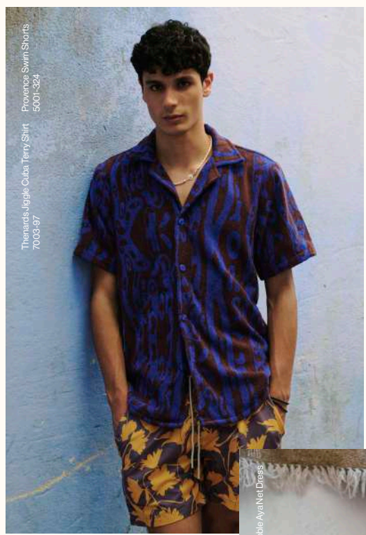
Thenards Juggle Clava Terry Shirt 7003-97 Provence Swim Shorts 5001-324