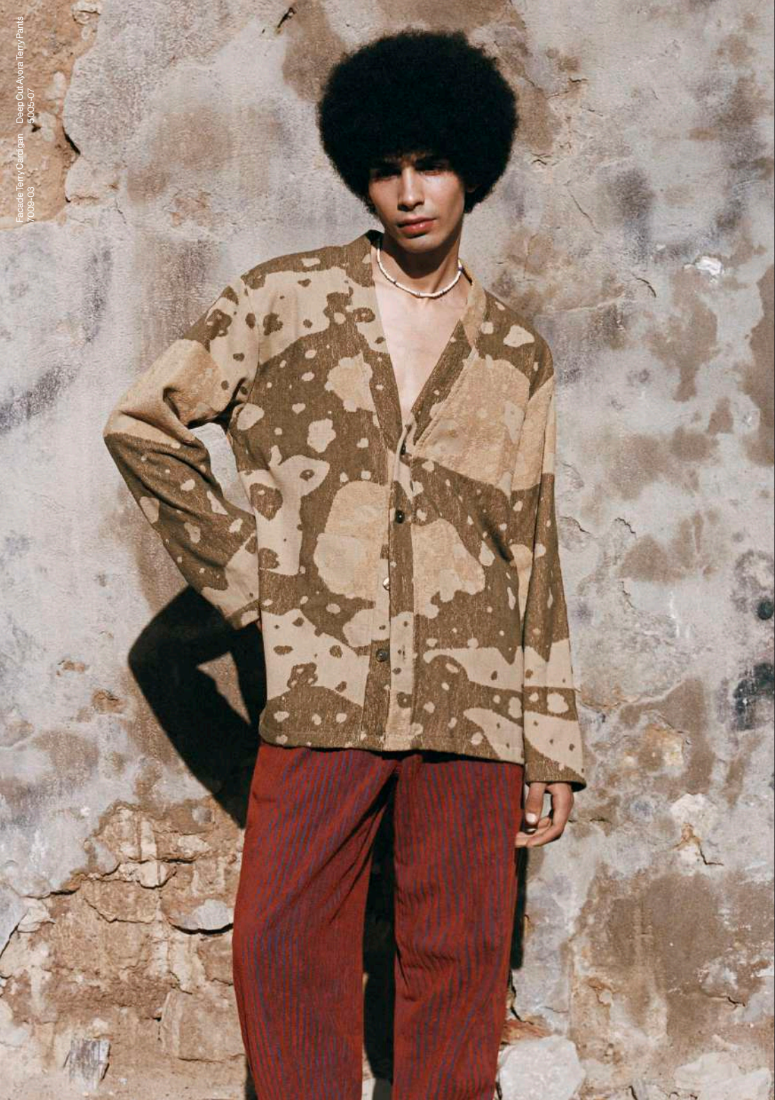
Facade Terry Cardigan - Deep Out Avora Terry Pants 7009-03 5005-07