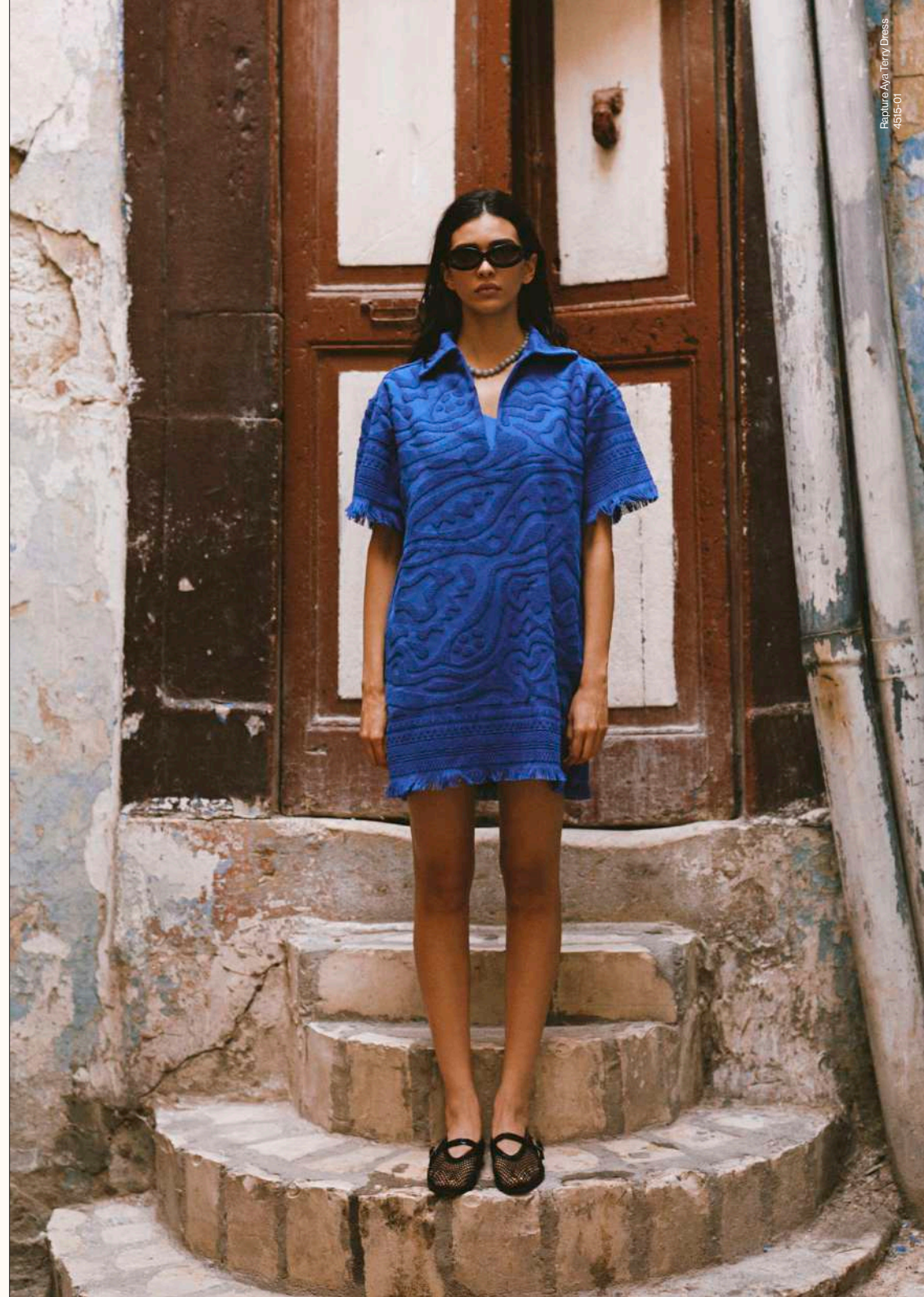
Pature Aya Terry Dress 451501